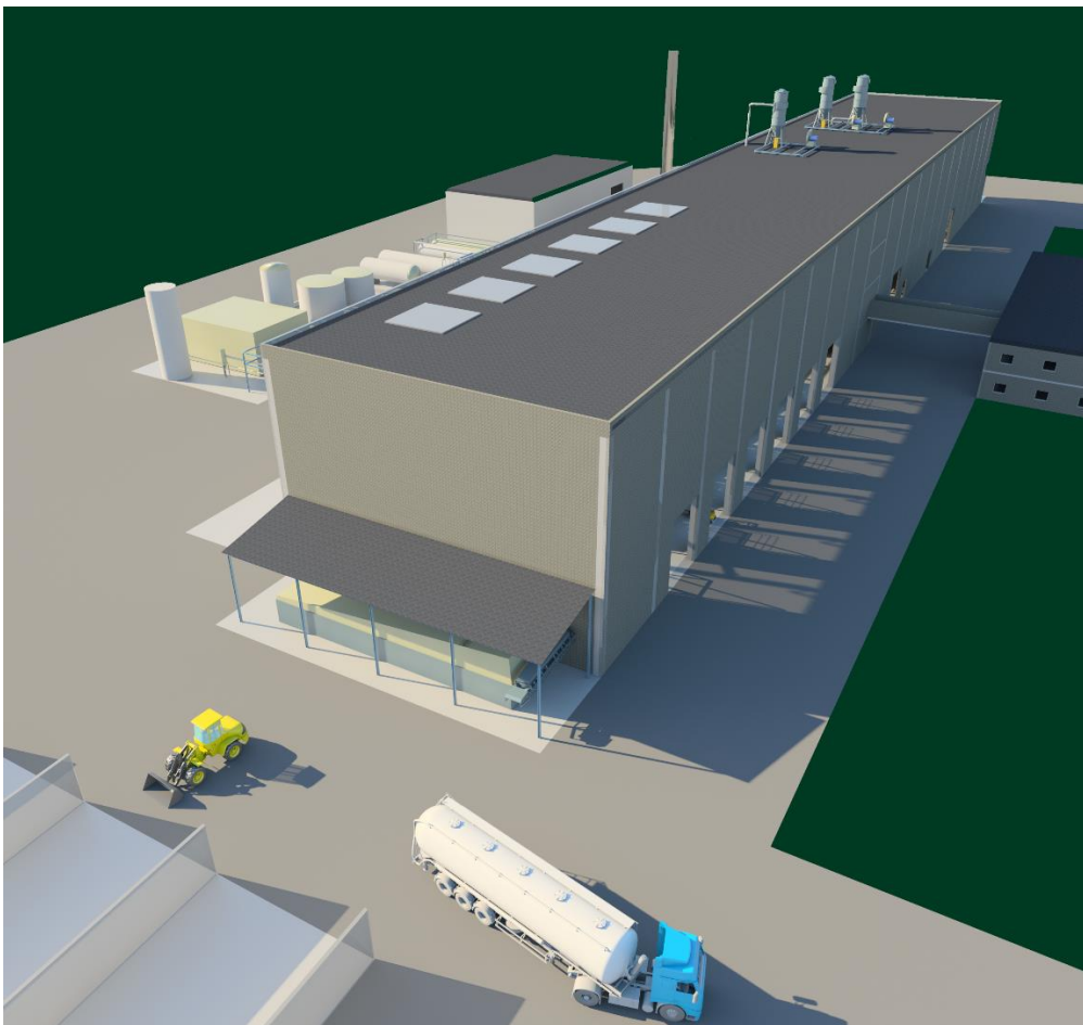
Above: Enviro's design of a pyrolysis plant with a capacity of 30,000 tons tyres/year and 9,000 tons of recovered Carbon Black